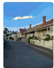
No 9 Queen st Sandy Bay environs.