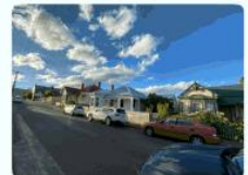
No 9 Queen st Sandy Bay environs.