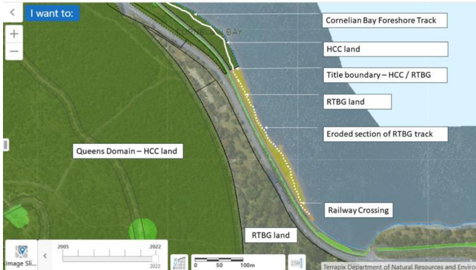
Figure 1 – Site Context and Features