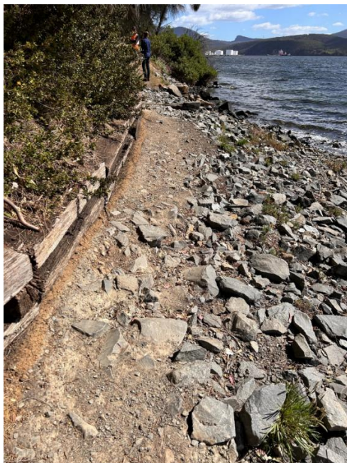
Figure 2 – Section of eroded track at water's edge on RTBG land