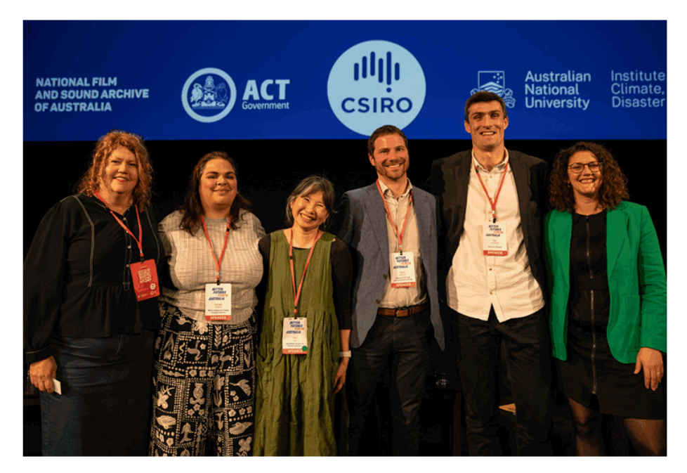
The Lord Mayor with fellow speakers at the Better Futures Forum Australia, September 2024