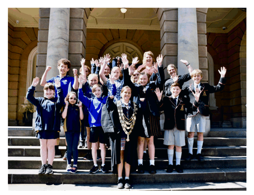
The Lord Mayor with the Children's Mayor winners and finalists at the Town Hall, October 2024