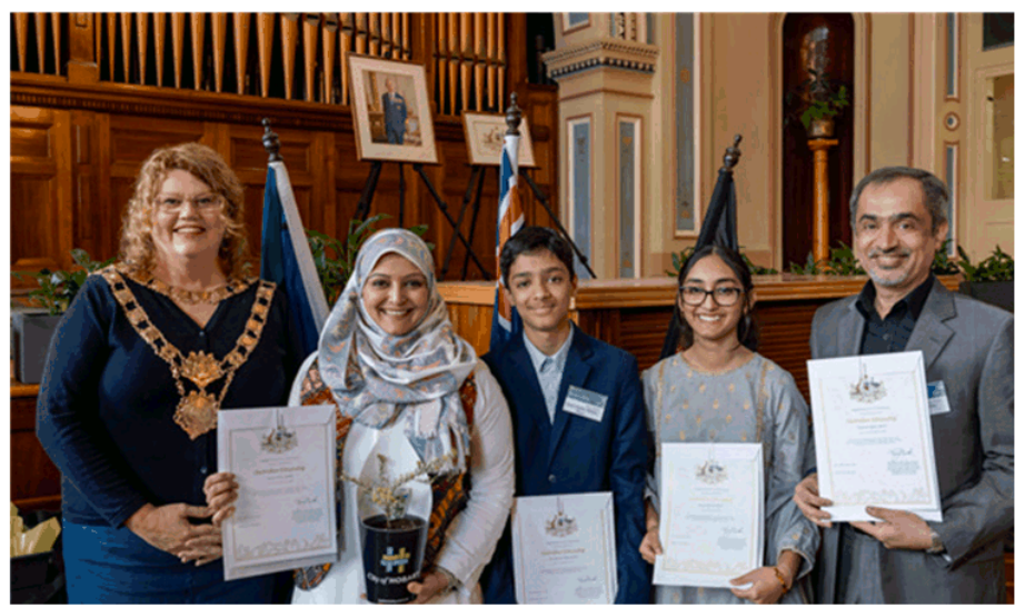
The Lord Mayor with new Australian citizens at one of the ceremonies held during 2024

"to carry out the civic and ceremonial functions of the mayoral office..."