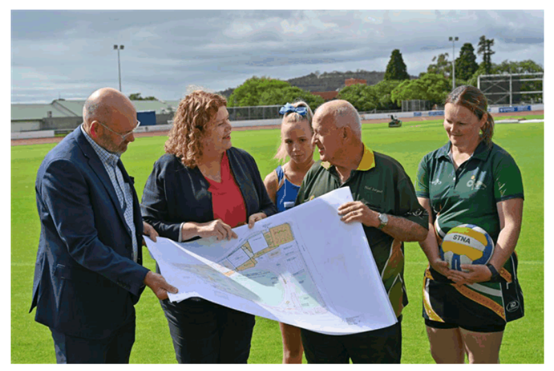
The Lord Mayor with representatives of Buckingham Bowls Club and OHA Netball Club discussing plans for upgrades to the New Town sporting precinct, March 2024

"to act as a leader of the community of the municipal area..."