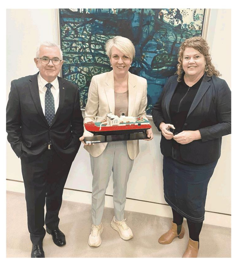
The Lord Mayor with Andrew Wilkie MP, Federal Member for Clark and Senator The Hon Tanya Plibersek at Parliament House, Canberra, July 2024