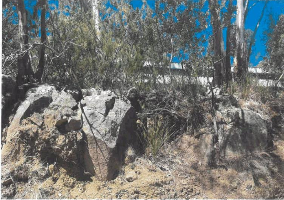
Over flow of East/West swale 2017