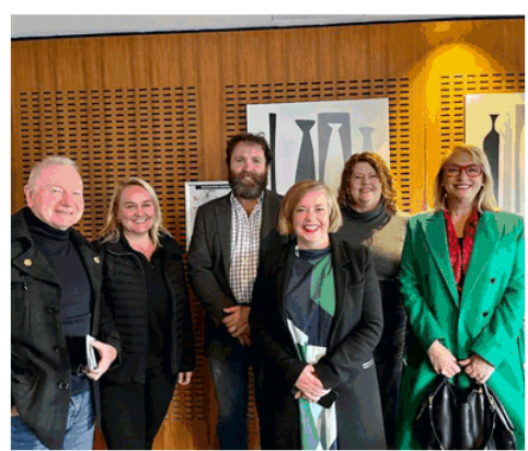
Capital City Lord Mayors meeting re climate change