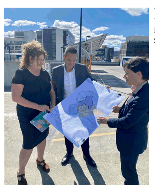
Central Hobart precinct plan

'to act as the spokesperson for the Council'