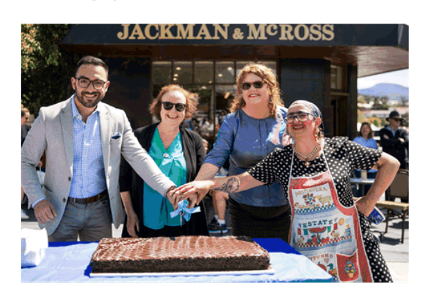
New Town Street Party