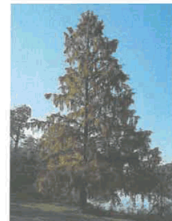
Mature tree in autumn