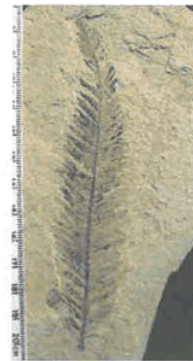
Eocene (Ypresian) age M. occidentalis branchlet

Strawberry Fields is a landscaped section in New York City's Central Park dedicated to Beatle John Lennon. At the northern end of the lawns are three dawn redwood trees. The trees drop their needles each fall and regrow them each spring, a symbol of eternal renewal. The trees are expected to reach a height of 36 meters (118 ft), making them visible from great distances.