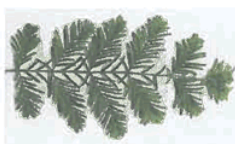
Dawn redwood foliage - note opposite arrangement

The bark and foliage are similar to Sequoia , but Metasequoia is deciduous like Taxodium distichum (bald cypress), and, similarly, older specimens form wide buttresses on the lower trunk. It is a fast-growing tree to 130–150 feet (40–45 m) tall and 6 feet (2 m) in trunk diameter in cultivation so far (with the potential to grow even higher).