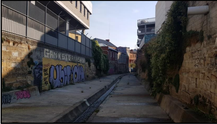
Figure 2: The open rivulet between Liverpool, Harrington, Collins and Barrack Streets

The rivulet is exposed for segments between the start of the Linear Park track, Molle St and across Barrack St, becoming enclosed near Liverpool St in the block between Barrack and Harrington St. As shown in Figure 2, the exposed rivulet runs adjacent to a variety of buildings in the city.