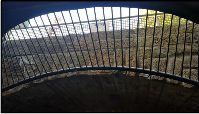
Figure 5: The Rivulet below Elizabeth St Mall