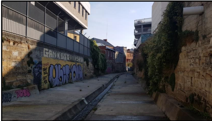
Figure 2: The open rivulet between Liverpool, Harrington, Collins and Barrack Streets