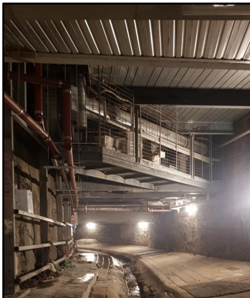
Figure 3: The Rivulet below the Cat and Fiddle Arcade

The rivulet runs underneath the Cat and Fiddle Arcade with parts of the lower floor of the building built into the rivulet void. Figure 3 shows a view from inside the underground rivulet of an area apparently used for storage at the rear of a shop within the arcade.