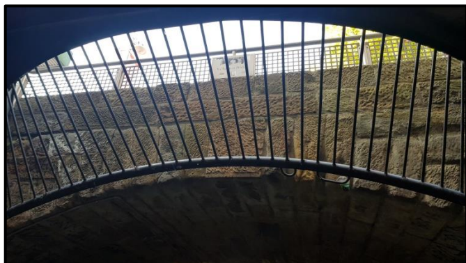
Figure 5: The Rivulet below Elizabeth St Mall

A now enclosed bridge (Wellington Bridge) is visible from the rivulet under the Elizabeth St Mall as shown in Figure 5.