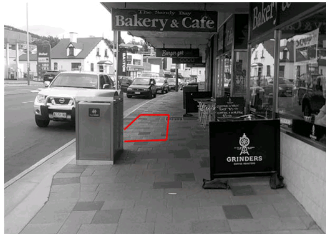
Figure 2 – Footpath at Sandy Bay Bakery and Café