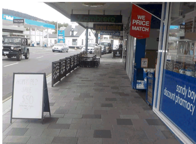
Figure 1 – Streetscaping fence at Brew and Zambrero