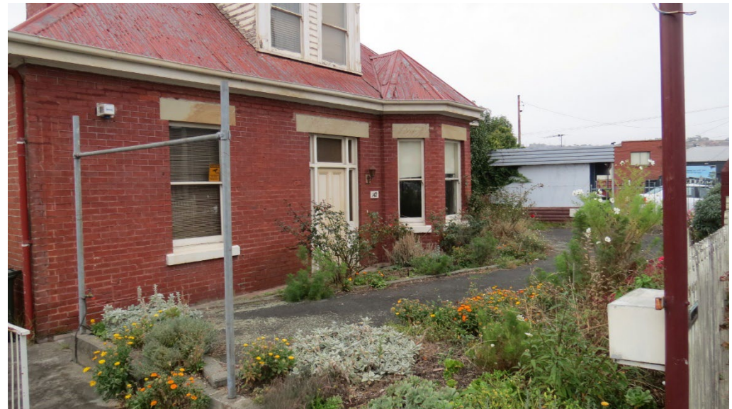
142 New Town Rd setback – 6.2 m