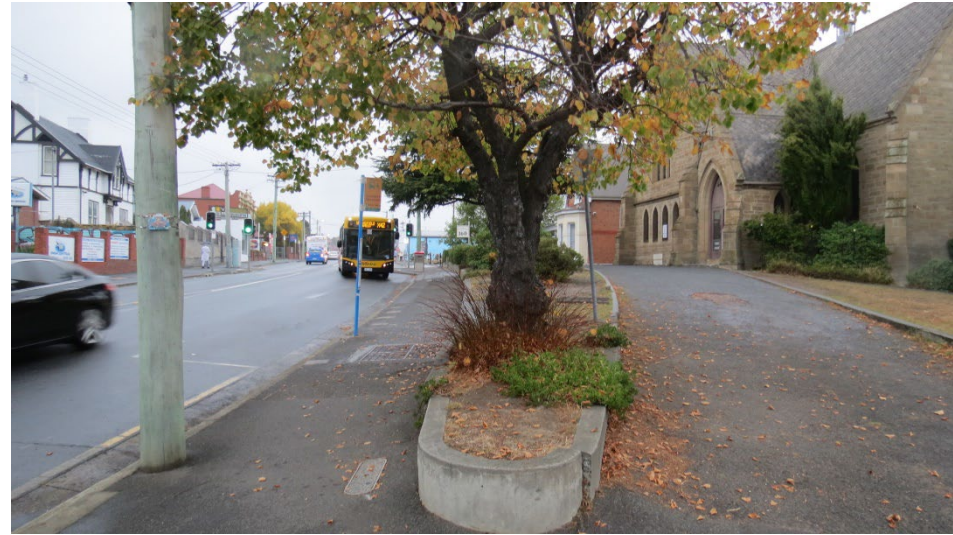
Cross Street Church set back – 9.3m