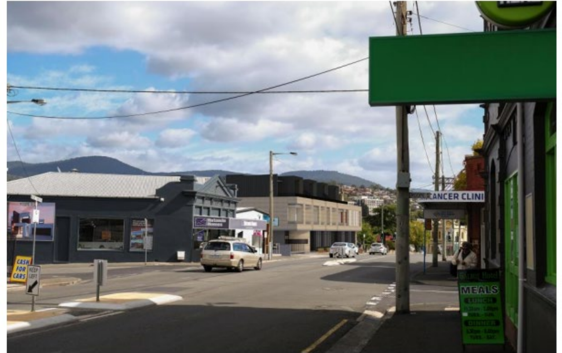
Proposed streetscape photomontage obscuring the Old Parsonage