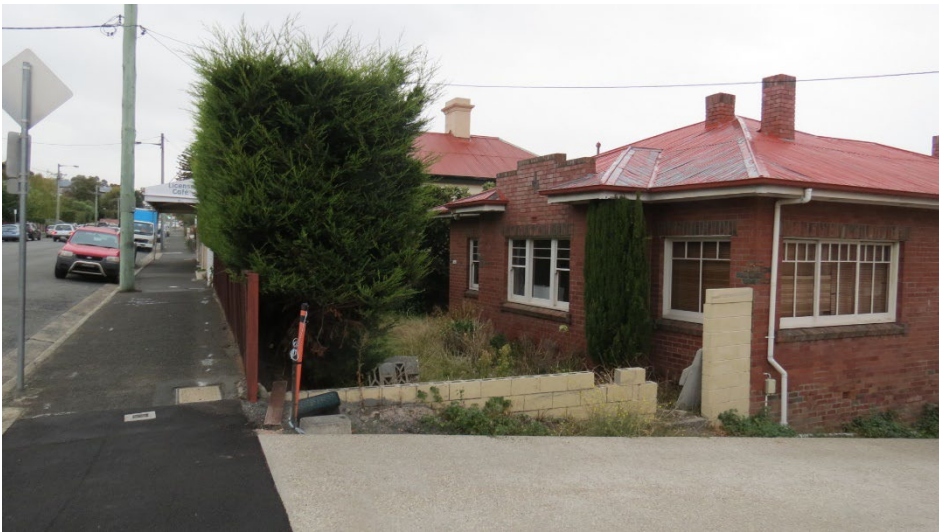
140 New Town Rd setback – 6.2m