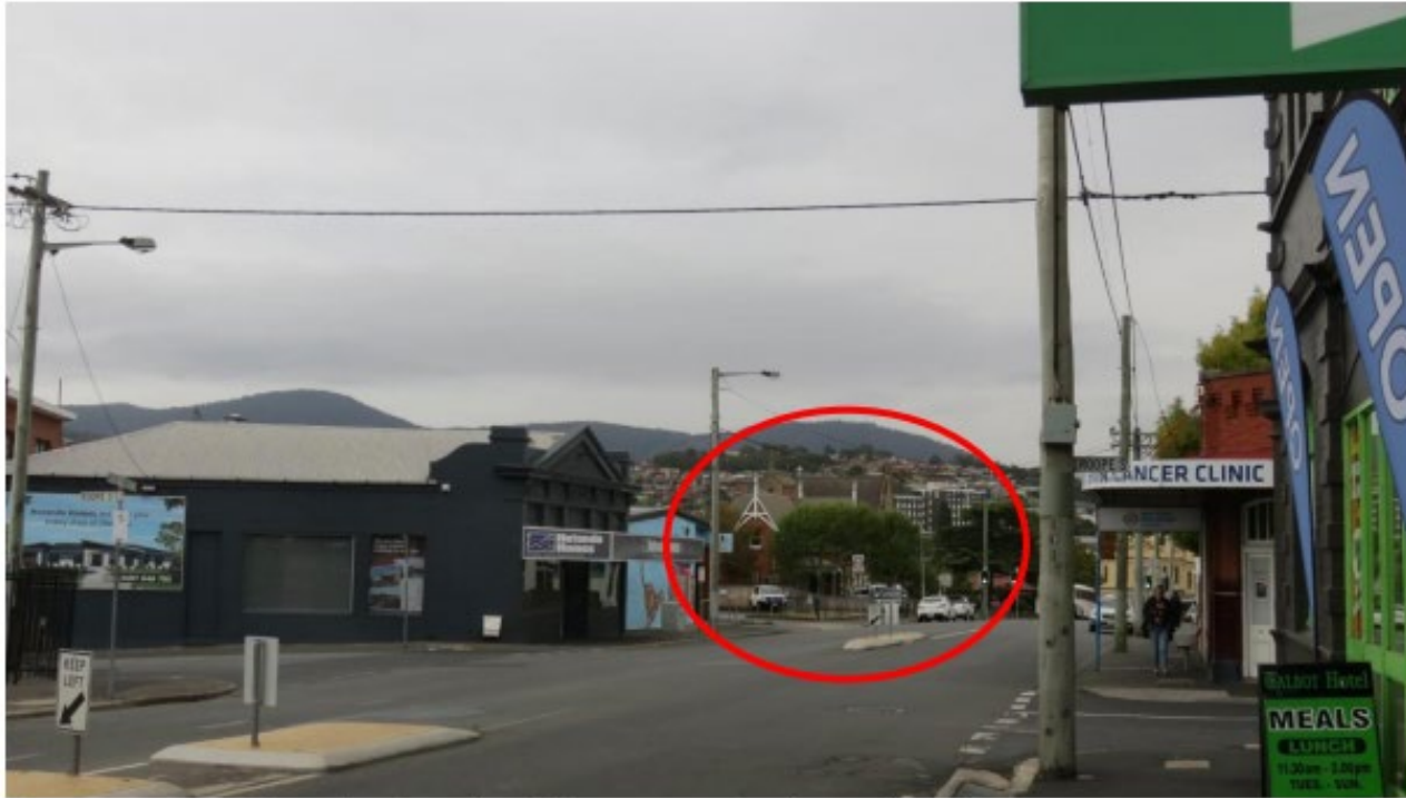
Current street view showing the Old Parsonage in the red circle