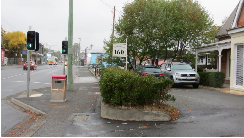
160 New Rd – Old Parsonage setback -7.5 m