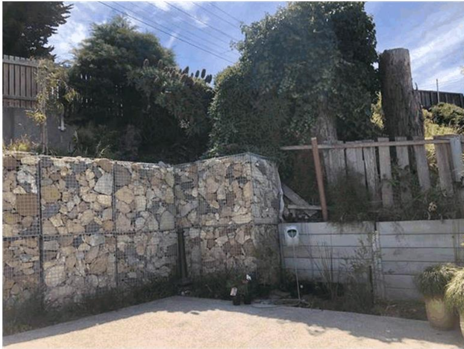
Existing wooden retaining walls on driveway not sufficient to accommodate additional traffic on premises and poses a risk to neighbours and residents