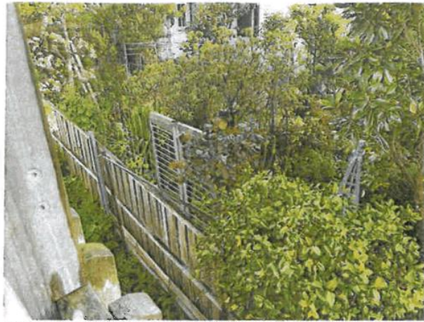
Plate 1: The adjoining property (21 Allison Street) opposite the existing proposed deck.