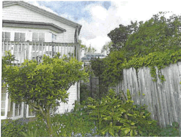
Plate 3: Looking back (towards the front of the site) at the existing deck, dwelling and south western side boundary from ground level.

6.7.6 To the east/north-east (Plate 4), the existing dwelling on this adjoining property has a single window opposite the existing deck which would similarly correspond with the initial part of the proposed deck. This window (Plate 5) is set below the balustrade level of the existing deck, with essentially half the window below and half above the deck surface level.