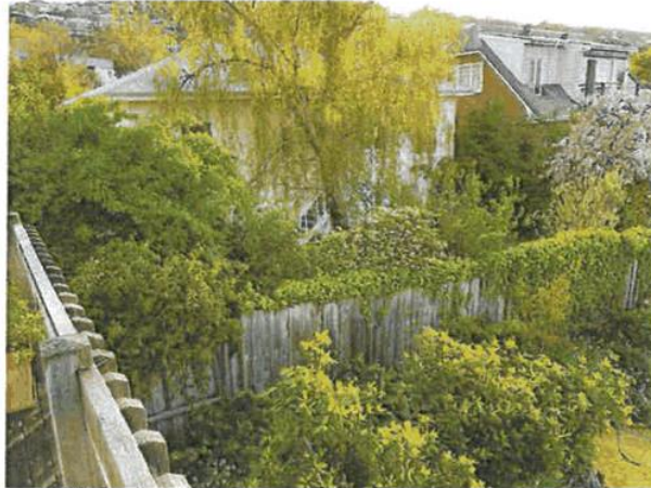
Plate 2: The adjoining property (2 Blackwood Avenue) opposite the proposed, extended deck location.