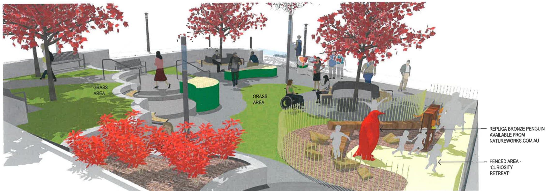
2 RENDERING FROM RIGHT-OF-WAY SCALE - NTS