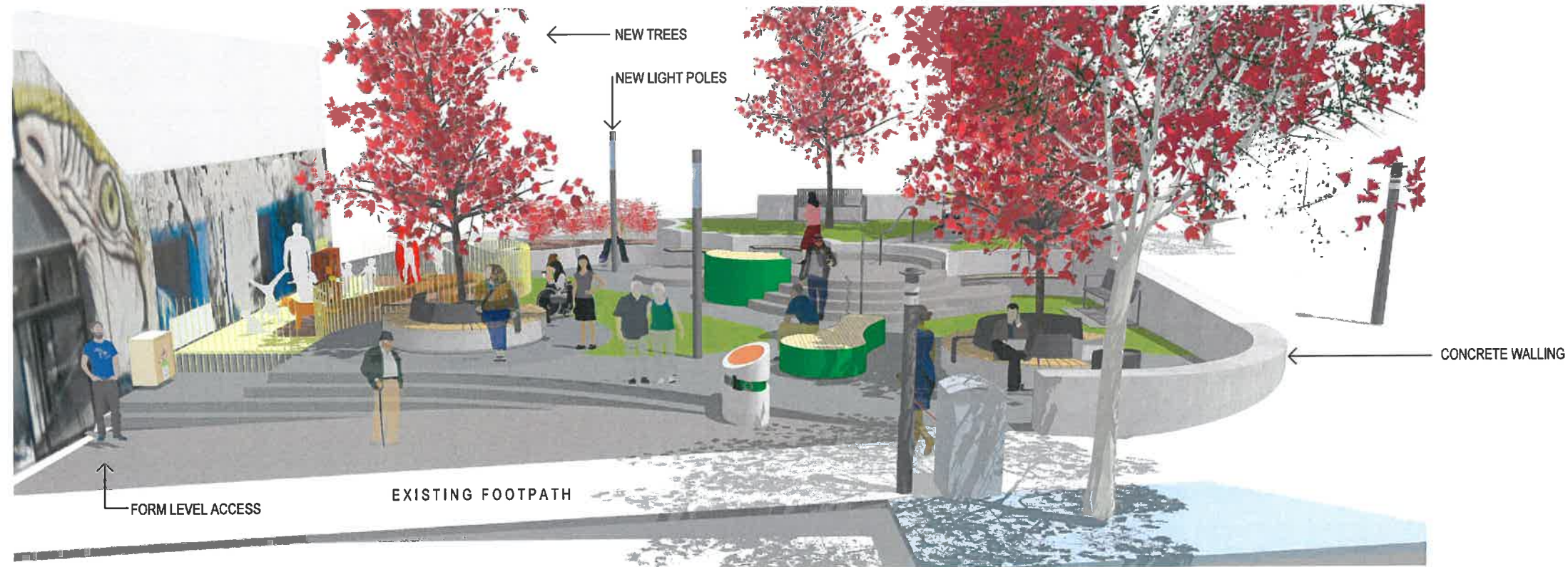
1 RENDERING FROM ELIZABETH STREET SCALE - NTS

NOTES - DO NOT SCALE OFF DRAWINGS - CHECK ALL DIMENSIONS ON-SITE