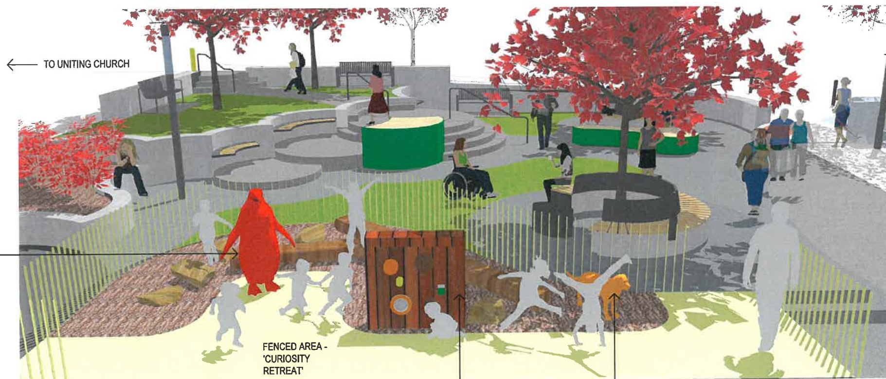
2 RENDERING OF FENCED AREA SCALE - NTS