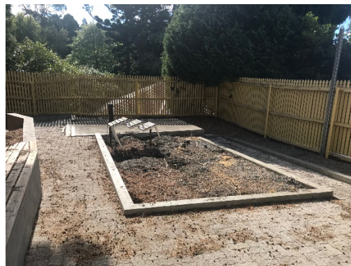
Buggy store site under construction