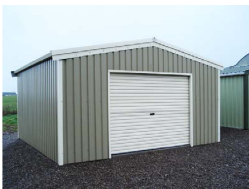
Proposed Buggy store

Additional works required for this project include widening of the access path leading to the new storage area and supply of mains power for recharging of the vehicles. The completion of the buggy store will provide secure storage for the vehicles, in a convenient location that will make them easily accessible for visitor services staff.