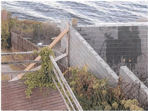
Hard up against Northern Boundary