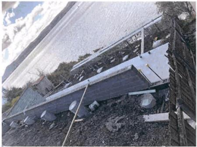
Hard up against Southern Boundary