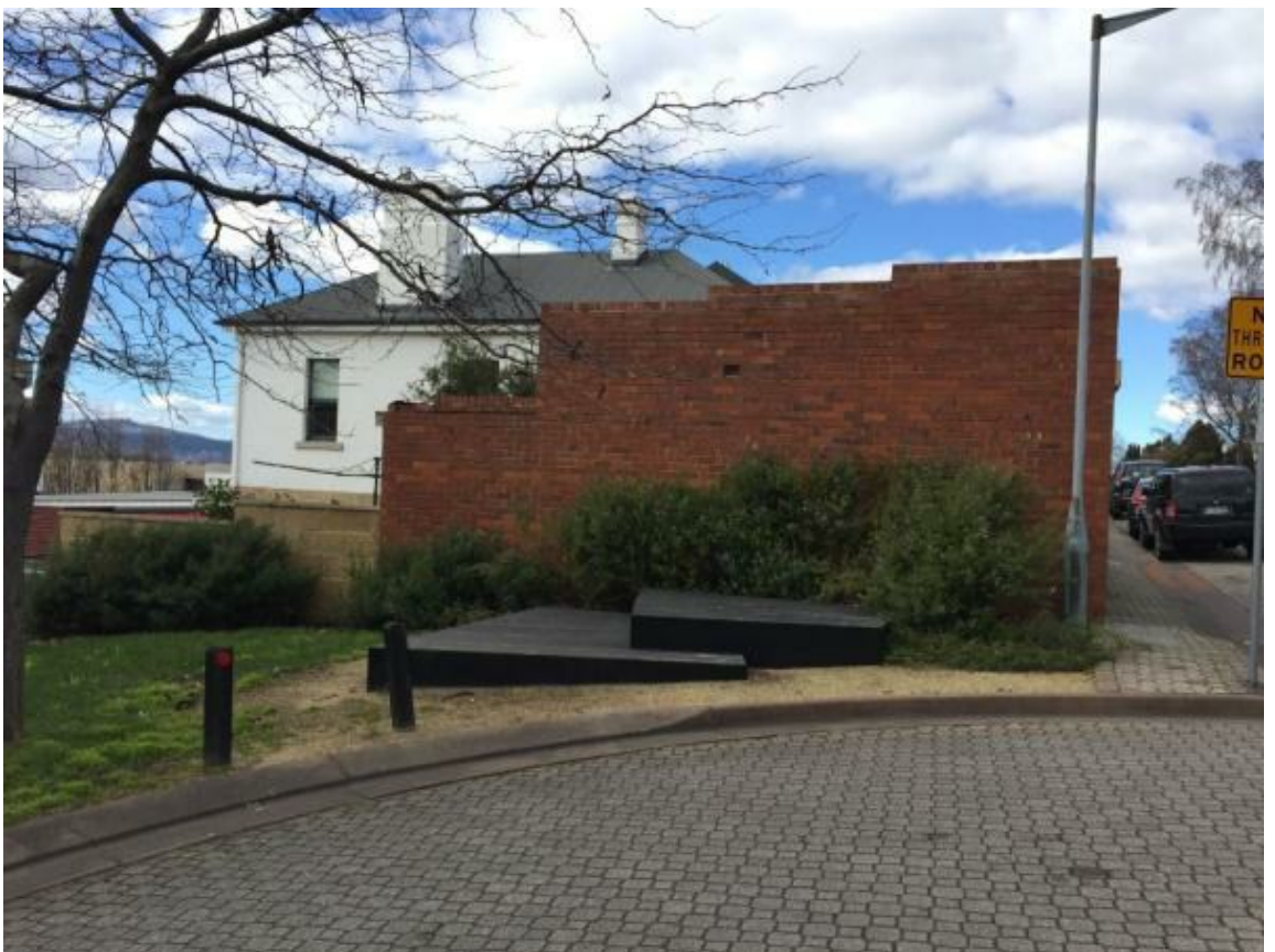
Figure 4: Western side of garage