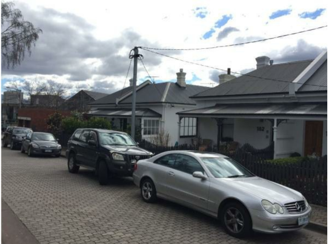
Figure 5: Looking towards site with the worker cottages in view