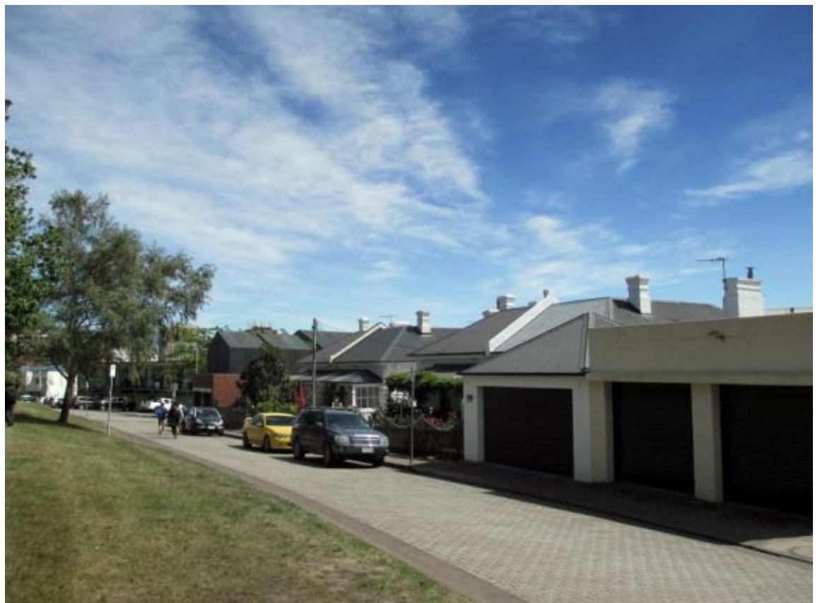
Figure 7: Photo Montage 1 showing the proposed development from the eastern end of Salamanca Place