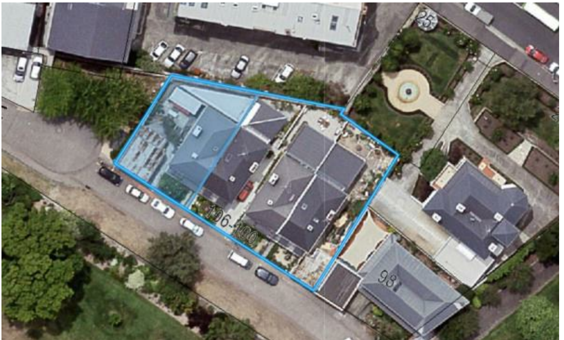
Figure 2: GIS Map Image 1:500