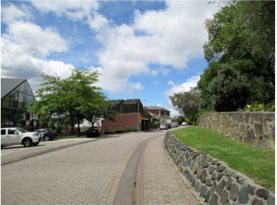
Figure 8: Photo Montage 2 showing the proposed development from the west.