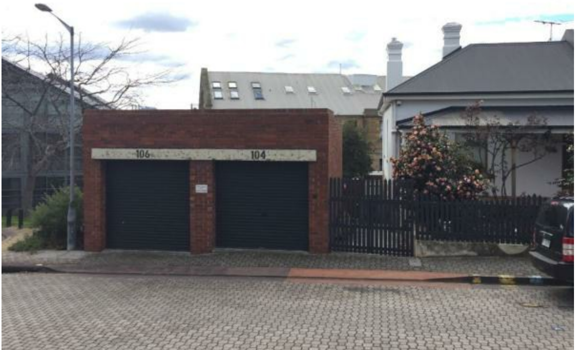
Figure 3: Existing garages that the dwelling is proposed to be sited above.