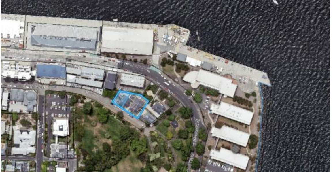
Figure 1: GIS Map Image 1:2000